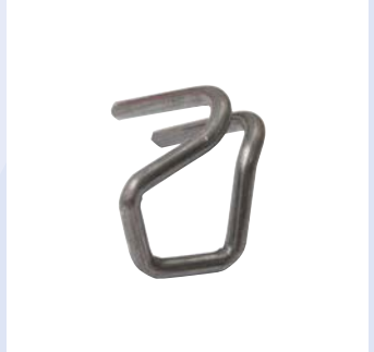
9,5 mm eyelet for 84.931