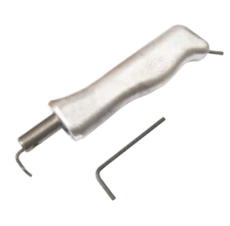
Tool for filler sections