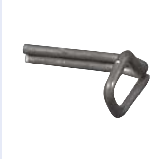
7 mm eyelet for 84.931