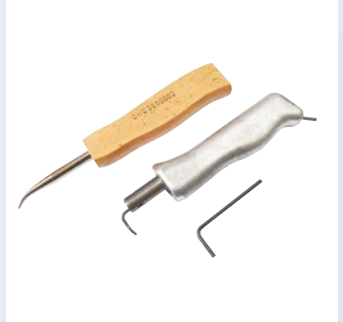
Tool set for inserting filler sections in glazing sections. Eyelet Ø 9,5 mm.