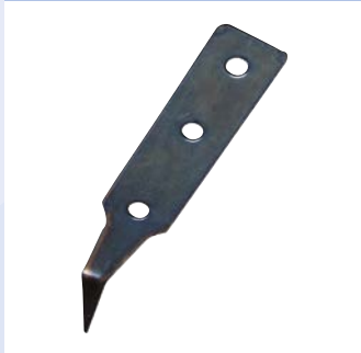
Cold cut knife blade for 84.840084. 19 mm.