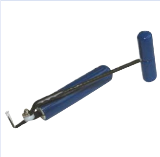
Cold cut knife