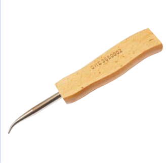
Tool for glazing sections with wooden handle