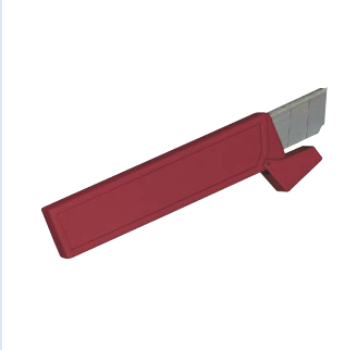
10 pcs. blades for S10.3312