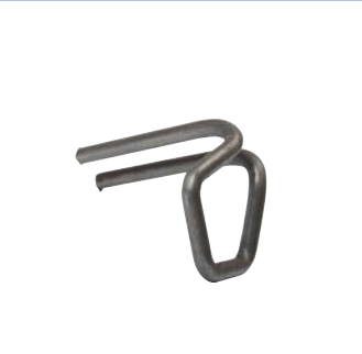
10,5 mm eyelet for 84.931