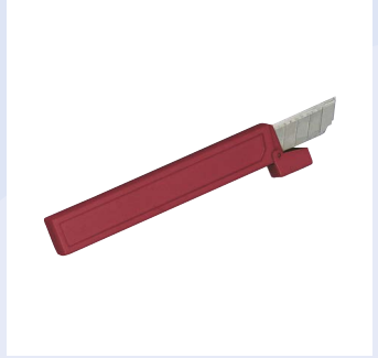
10 pcs. blades for S10.3311